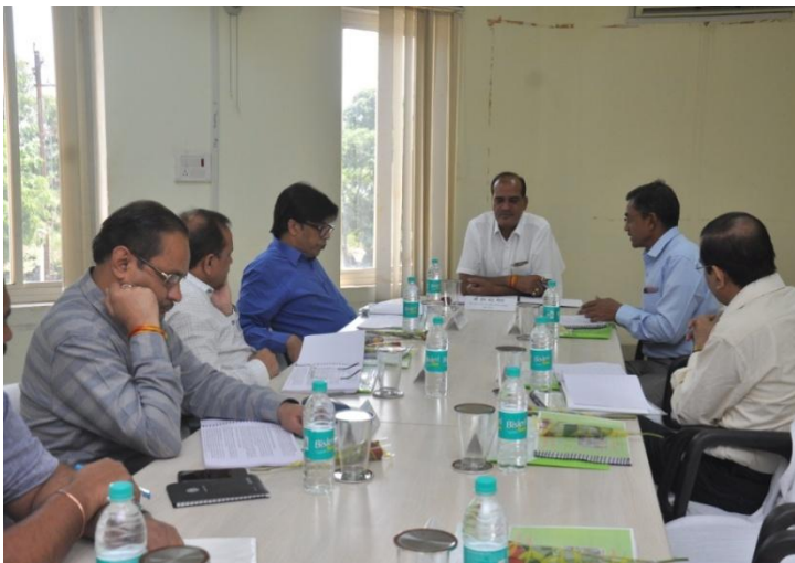
Review meeting by APC & PS Agriculture

The series of administrative orders were issued by the state government to systematize the training scenario as per the state training policy. Simultaneously the name of the state center was changed to State Institute of Agriculture Extension & Training shortly known as SIAET and declared as an autonomous apex training institute. Till then it is continuously being strengthened year after year.